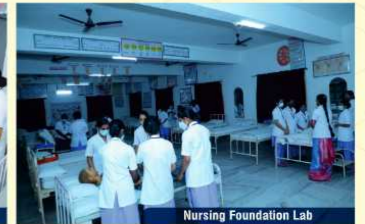
Nursing Foundation Lab

Eligibility: 10+2 Passed with Science (Physics, Chemistry and Biology) and English is compulsory subject. 45% aggregate of marks in Science Subjects, 40% in case of SC, ST and BC candidates. Intermediate Vocational with Bridge Course in Biological and Physical Sciences