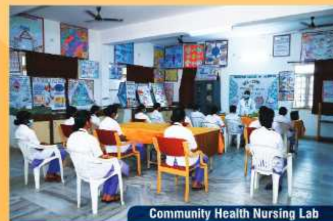
Community Health Nursing Lab

Those who qualify with this course have better knowledge and can select the best career options on higher working levels.