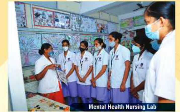
Mental Health Nursing Lab

A Bachelor of Science in Nursing (B.Sc. Nursing) is a four-year undergraduate professional degree that train the students to provide nursing care in hospitals, clinics, Community areas. The program educates students on procedures and protocols used by paramedical and teaching staff, and covers subjects such as physiology, anatomy, biochemistry, nutrition and dietetics, psychology, and more. Upon completion, graduates of the program can pursue a range of career opportunities in both public and private sectors.