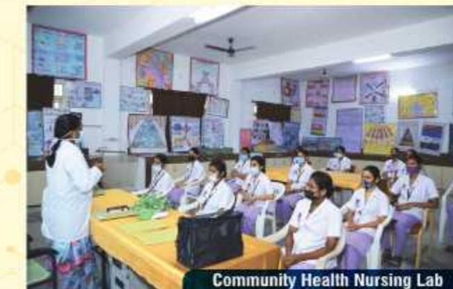
Community Health Nursing Lab