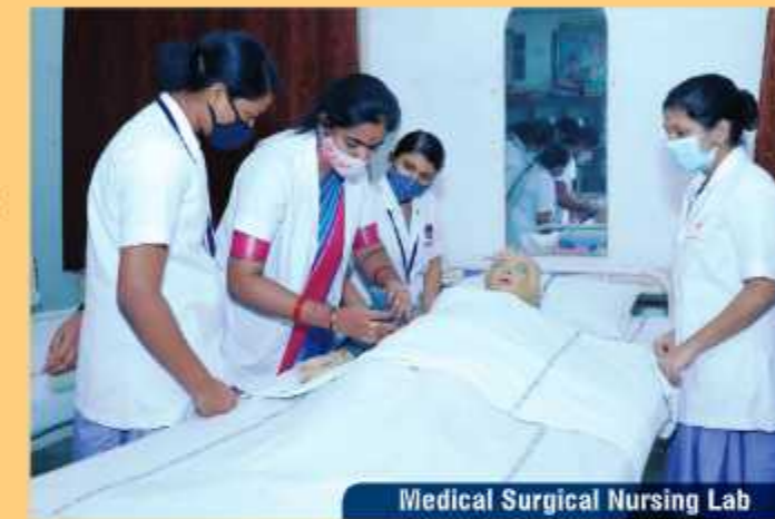
Medical Surgical Nursing Lab