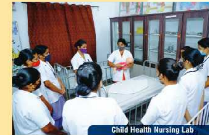
Child Health Nursing Lab