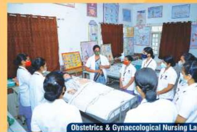
Obstetrics & Gynaecological Nursing Lab