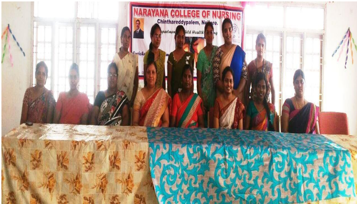
Table 1: Frequency and Percentage distribution of level of knowledge among participants in Pre-test (N=70)

Certificates were distributed to all the participants. Vote of thanks was proposed by Ms. Ruth Grace. M, followed by a National Anthem. The pre and post test results showed that there was enhancement in the knowledge of the students regarding intrauterine fetal surgeries.