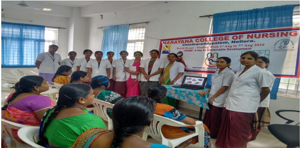
BREAST FEEDING WEEK CELEBRATIONS IN POSTNATAL WARD, AT NMCH, NELLORE