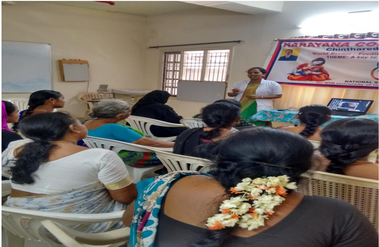
BREAST FEEDING WEEK CELEBRATIONS IN ANTENATAL OPD AT NMCH, NELLORE